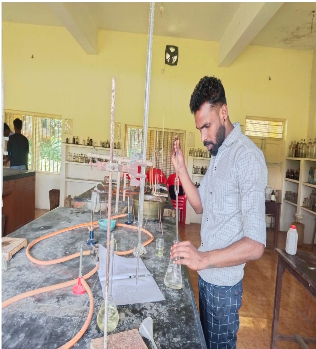
STUDENTS CONDUCTING EXPERIMENTS IN THE CHEMISTRY LAB AS A PART OF EXPERIENTIAL LEARNING