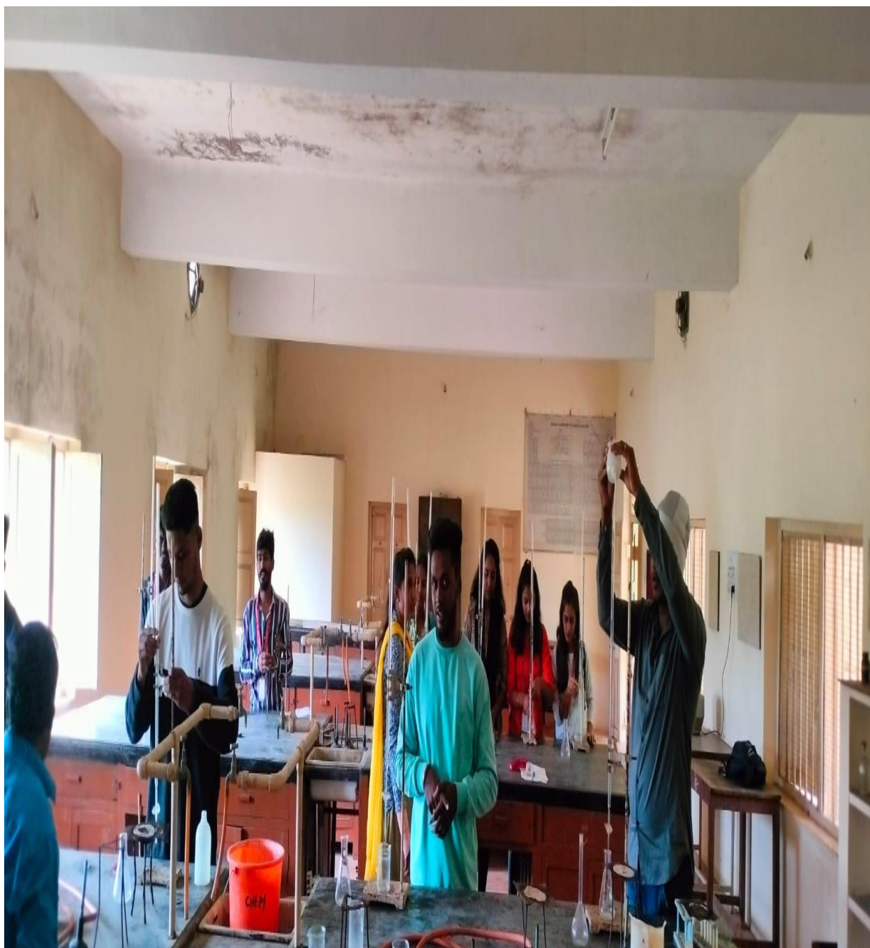
STUDENTS CONDUCTING EXPERIMENTS IN THE CHEMISTRY LAB AS A PART OF EXPERIENTIAL LEARNING